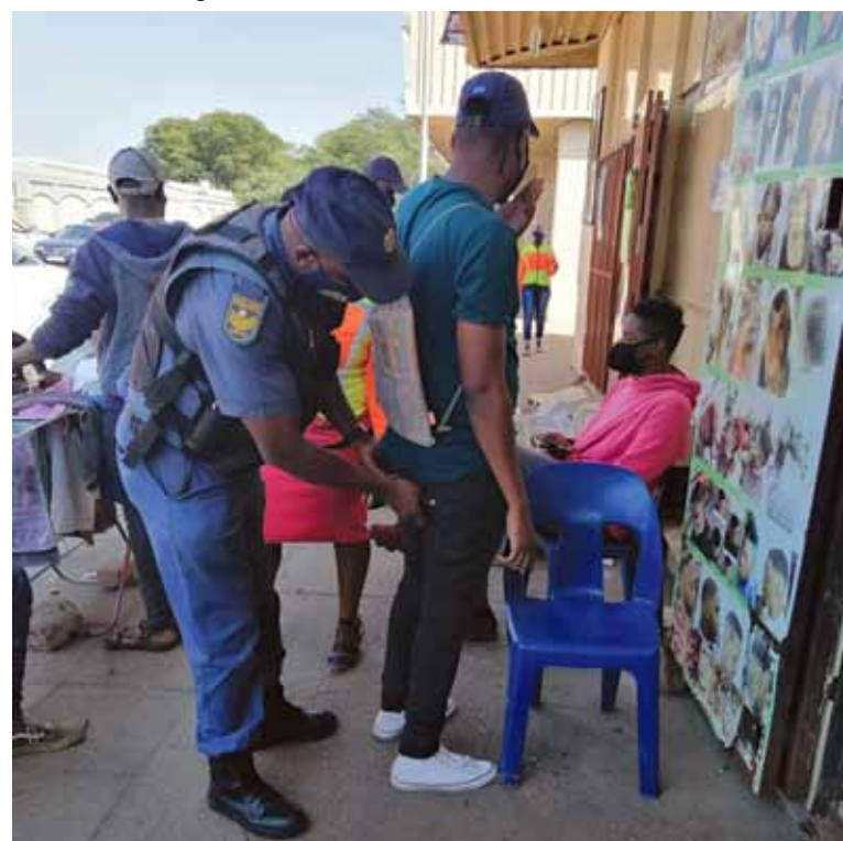
Stop and searches and tracing of wanted suspects were executed by the police in the province during the operations.