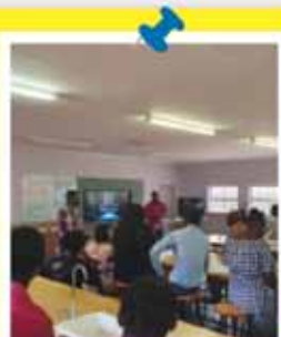
Tswako Primary School (x1)