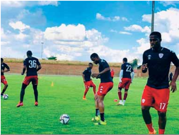
Sekhukhune United FC will have to wait for the court ruling to know whether they will be promoted to the PSL top flight or not.