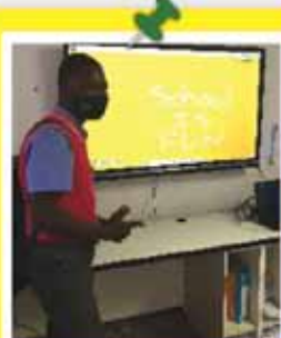
Graceland Combined School (x1)