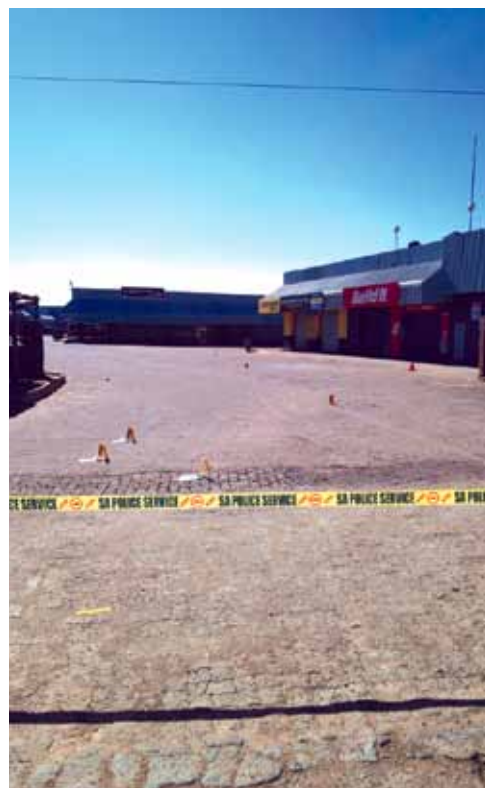
Moteti Top Spot Shopping Centre was totally closed for operations after criminals blasted four ATMS.