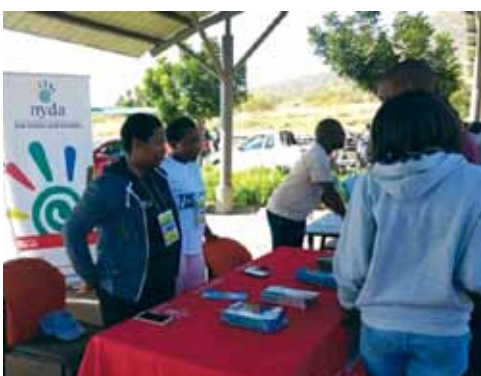
The National Youth Development Agency (NYDA), formed part of the Royal Necklace Exhibition held at Thaba Moshate on Friday 28 May.