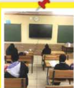
Metz Mamahlola Primary School (x5)